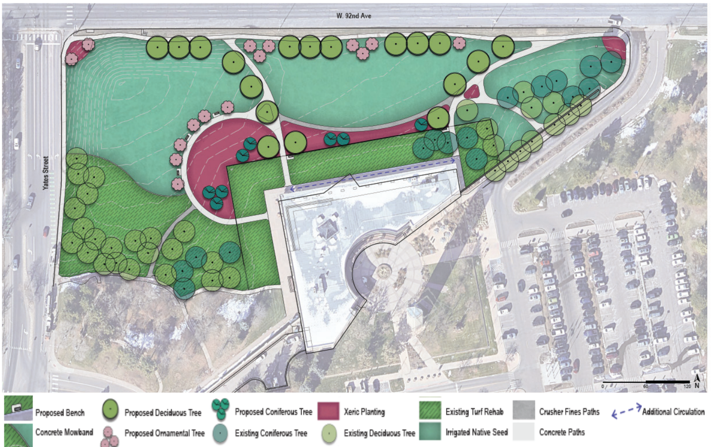
Figure 3: Stream Landscape Architecture and Planning's Design for City Hall North Lawn Pilot Parcel