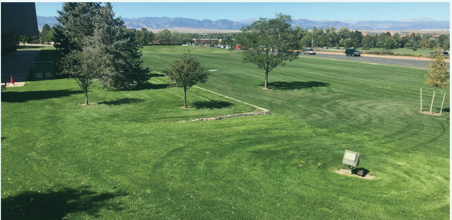
Figure 2: City Hall North Lawn Pilot Parcel Existing Turf