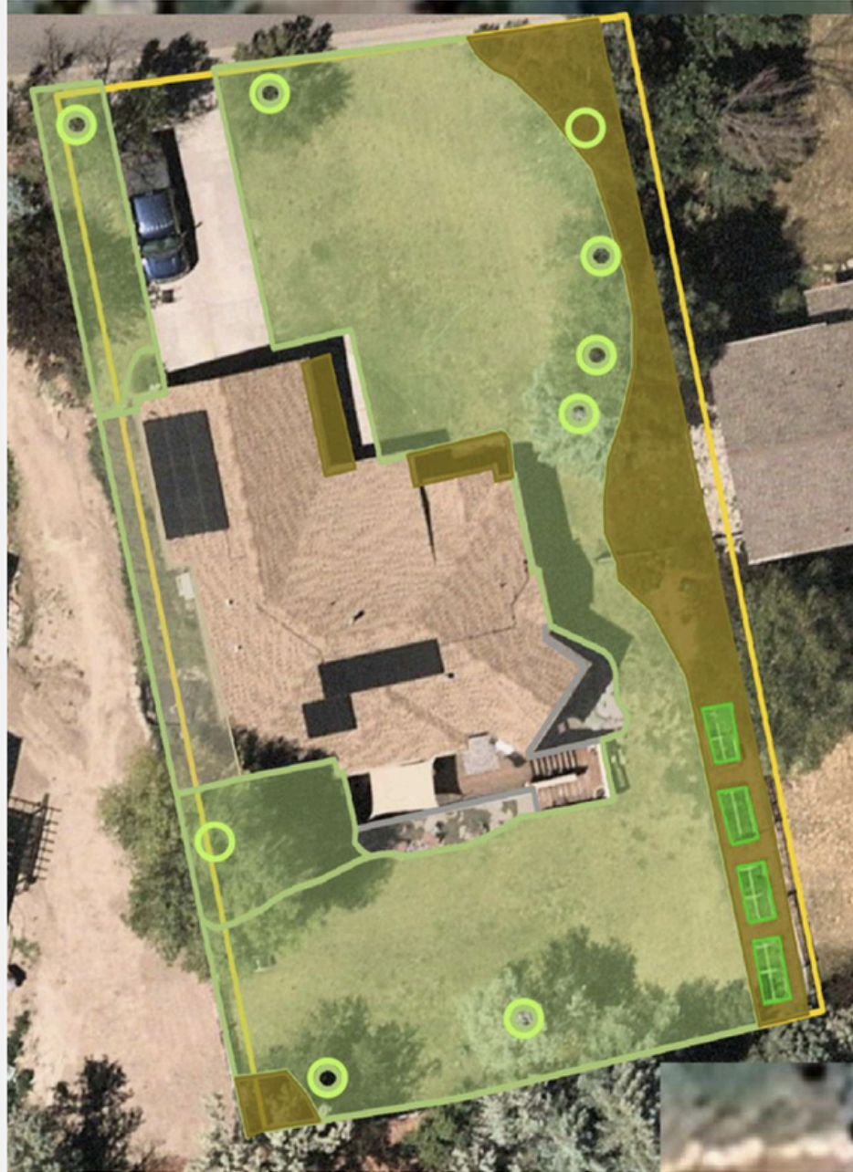
Layers on the Map