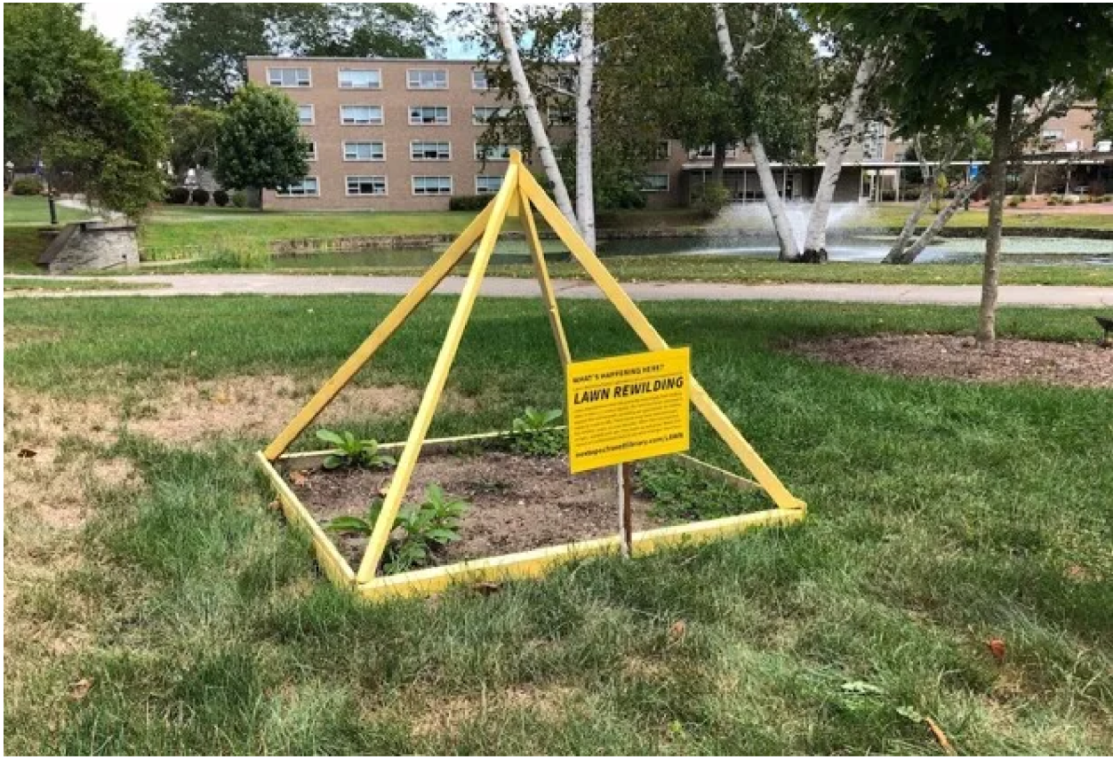
A test plot at Wheaton College in Massachusetts in 2019.

What emerges can be unpredictable. Irons stopped by the three Wheaton plots over Labor Day weekend, and although they're no more than 100 yards apart, they were distinctly different.