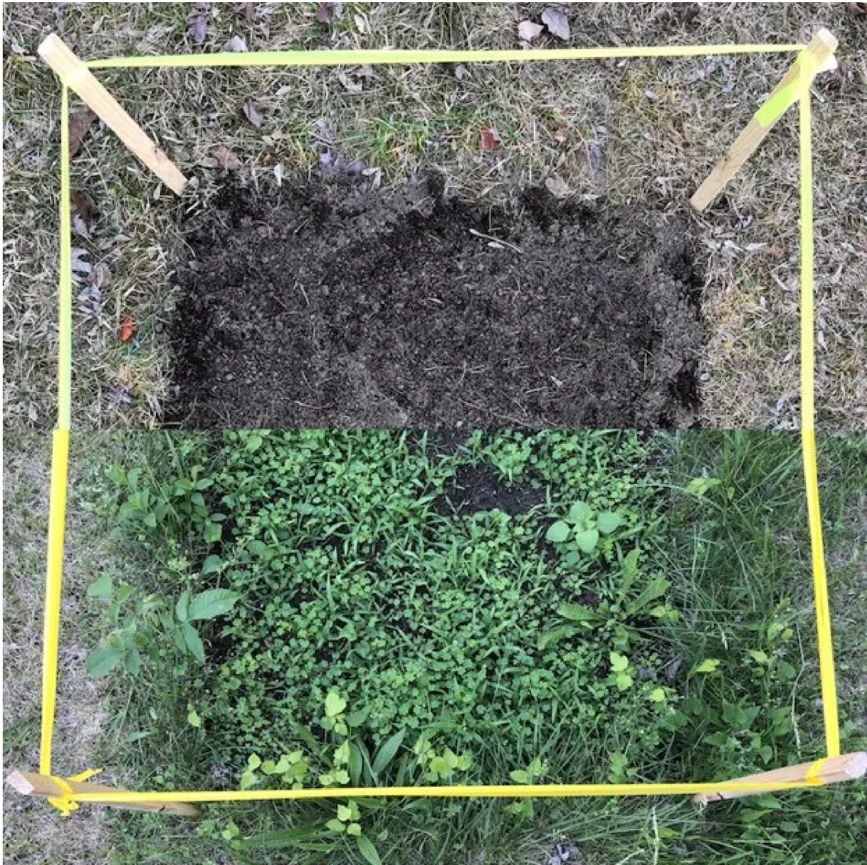
A before-and-after composite photo shows the progress of a plot in a residential yard in Troy over a period of about two months in 2018.

In 2020, the artists plan to expand Lawn (Re)Disturbance Laboratory , with further research into soil temperatures, insect levels, and other changes that occur in these test plots. Although it's a small-scale project, each opening brings insight into a lawn's potential to better support local ecology.