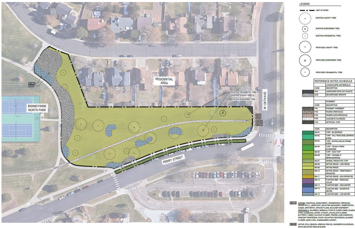
Figure 4: Norris Design's Brandywine North Parcel Design

BROOMFIELD TURF REPLACEMENT PILOT | BRANDYWINE NORTH PARCEL PROPOSED CONDITIONS 01/15/2025