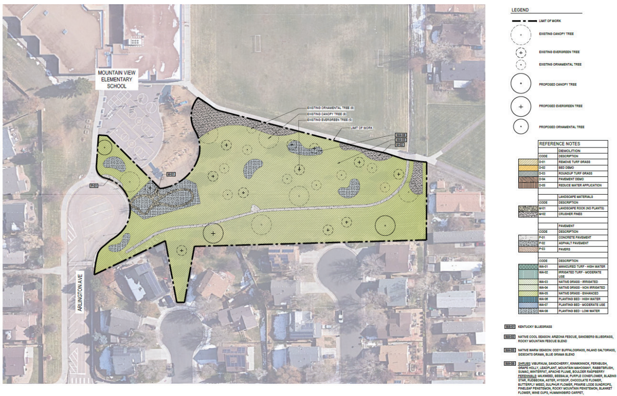
Figure 3: Norris Design's Brandywine West Pilot Parcel Design

BROOMFIELD TURF REPLACEMENT PILOT | BRANDYWINE WEST PARCEL PROPOSED CONDITIONS