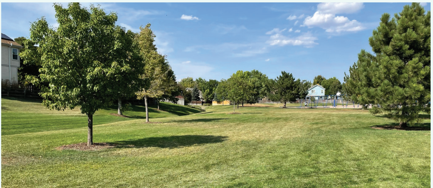
Figure 2: Brandywine West Pilot Parcel Existing Turf